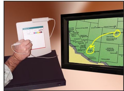
The Pointmaker PVI-44 color video marker main unit (left) with digitizing tablet.

GET ATTENTION WITH COLOR. Choose up to 7 different colors to separate points being made or to increase contrast with the background image.